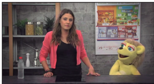
Figure 1. Nutritionist tells Nutriñeco the importance of drinking water ( Introduction ).