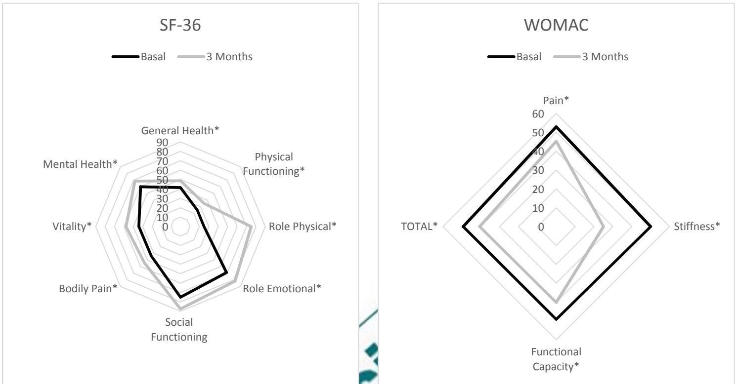
Fig. 2. Variation of the different areas of the SF-36 and WOMAC tests before the start of the intervention and three months later. *Significant difference ( p < 0.05 ).